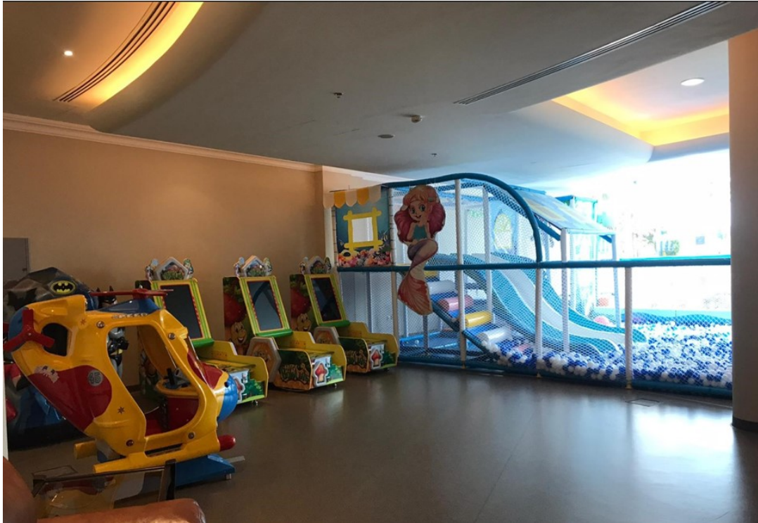
Above is a view of the soft play area in Dukhan Community Center.

Dukhan Cinema is considered one of the oldest Cinema houses in Qatar and the GCC. The Cinema was established in 1954 to screen films in the open air for its employees residing in Dukhan. In the 1990s, the Cinema building was renovated and is now known as Dukhan Cinema.